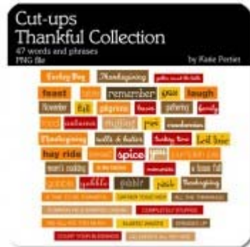
Cut Ups: Thankful by Katie Pertiet