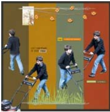
Last Mowing of 2009

And here are just a few of the items that she used in her layout: