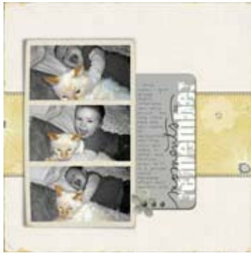
ssl chester and ava

Congratulations to roxygirl78 . Her layout ssl chester and ava has been selected as the featured layout of the week where she won a $ 5 DesignerDigitals Gift Certificate for product of her choice!