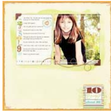
10 things - 2009

Congratulations to michelleL . Her layout 10 things - 2009 has been selected as the featured layout of the week where she won a $ 5 DesignerDigitals Gift Certificate for product of her choice!