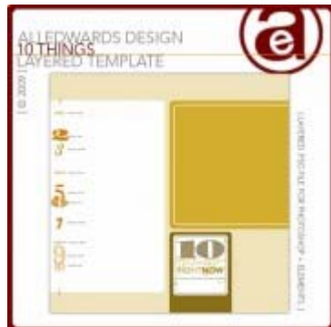
10 Things Layered Template by Ali Edwards