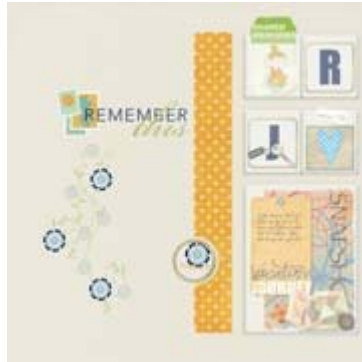
Page 16 left

Congratulations to Monique1971 . Her layout Page 16 left has been selected as the featured layout of the week where she won a $ 5 DesignerDigitals Gift Certificate for product of her choice!