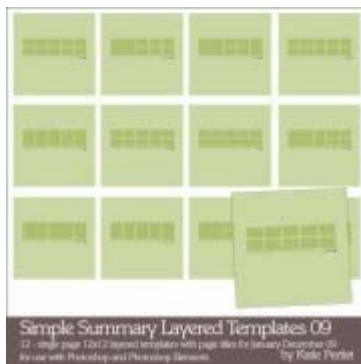
Simple Summary Layered Templates 2009 by Katie Pertiet

And here are just a few of the items that she used in her layout: