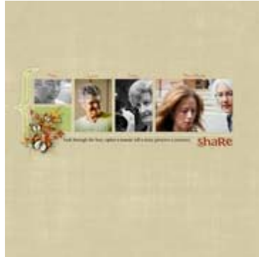
San Antonio Digi Crop - Pg 5

been selected as the featured layout of the week where she won a $ 5 DesignerDigitals Gift Certificate for product of her choice!