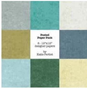
Posted Paper Pack by Katie Pertiet