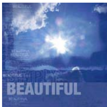
something from above

Congratulations to dorah . Her layout something from above has been selected as the featured layout of the week where she won a $ 5 DesignerDigitals Gift Certificate for product of her choice!