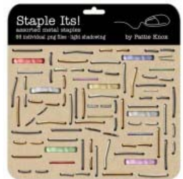
Staple Its! by Pattie Knox

Don't forget about Thrifty Thursday where over 200 items from various designers are marked down 30%! You can check out the items in the store and mark your calendar for an email reminder on the calendar . And you only need to sign up once for weekly reminders!