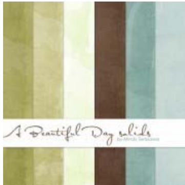
A Beautiful Day Solids Paper Pack by Mindy Terasawa