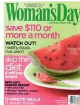
Color Challenge by Pattie Knox

And three new challenges with freebies! You will need to sign into your Community account to get these. If you do not have an account yet you can create one in our Community .