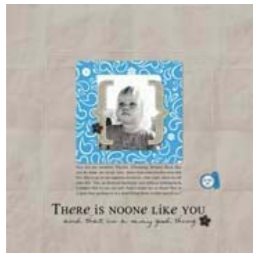
Noone like you

And here are just a few of the items that she used in her layout: