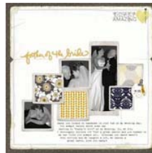
Father of the Bride