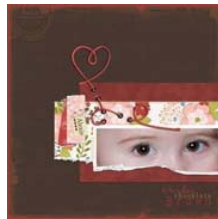
Hersey Chocolate Brown