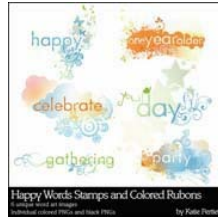
DD 4th Birthday Freebie – Happy Words

Happy Birthday to us... Happy Birthday to us... We're turning 4 years old this week and we're getting started with a storewide sale where everything is marked down 15% off and a happy freebie available thru 6am EST Tuesday morning! And the celebrating will continue into April, you won't want to miss out!